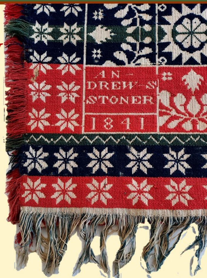
— Object# 2023.001.001 Renfrew Museum and Park