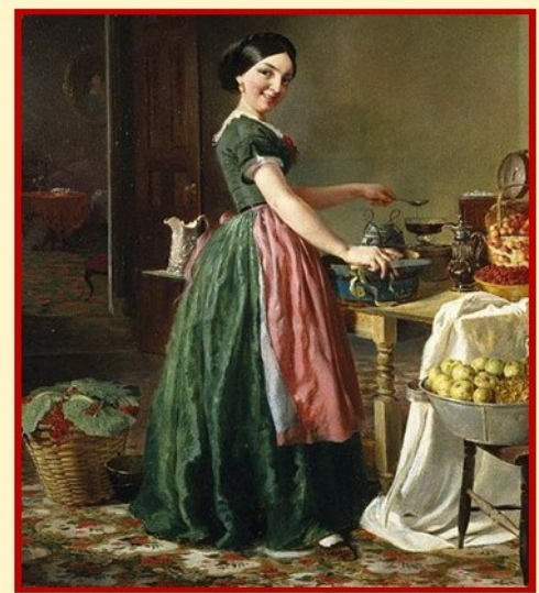
Lilly Martin Spencer. Kiss Me and You'll Kiss the Lasses , 1856. Oil on canvas. Collection of Brooklyn Museum.