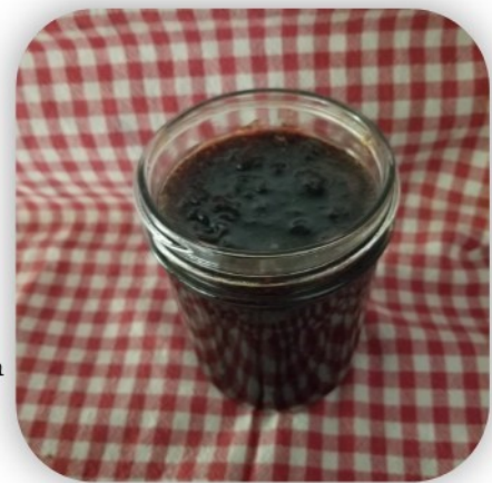
Pint of Gooseberry Jam made from berries harvested from Renfrew's Pennsylvania German Four-square Garden to be auctioned off at this year's 7th Annual Oktoberfest.

Renfrew's modest gooseberry harvest this year yielded enough fruit for one pint of jam! Using the above 1856 recipe, our staff created one jar of preserves to be offered at the silent auction during Renfrew's 7th Annual Oktoberfest Fundraiser (see pages 5 & 6).