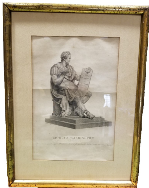
Giorgio Washington Engraving - #1992.001

Decorative Arts Objects of the Federal & Jacksonian Eras from the collection of Renfrew Museum and Park