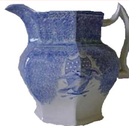
Transfer and Spongeware Patriotic Pitcher - #2015.15