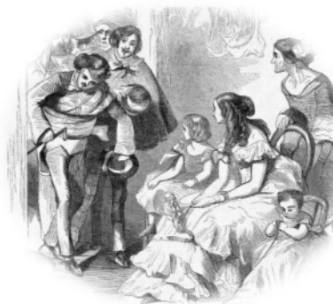
New Year's Day Calling, 1859 Harper's Weekly

Or the "Wishing-in and Shooting-in of the New Year"