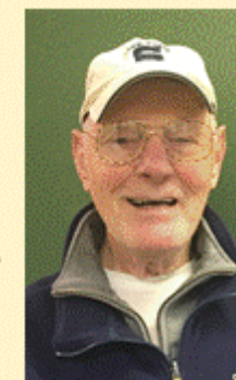
Red Mohn Accessions Committee