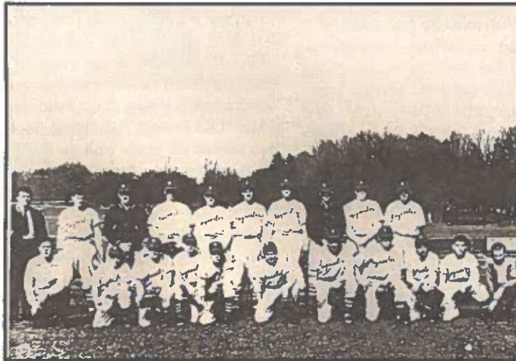
1948 Waynesboro High School Team