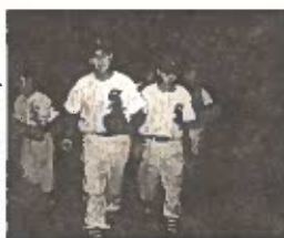
Nellie with White Sox

In 1949 he moved to the majors, signing with the White Sox. By 1951, he was considered one of the most dependable players, a strong second baseman, and was named an All-Star Player for the first, of twelve times.