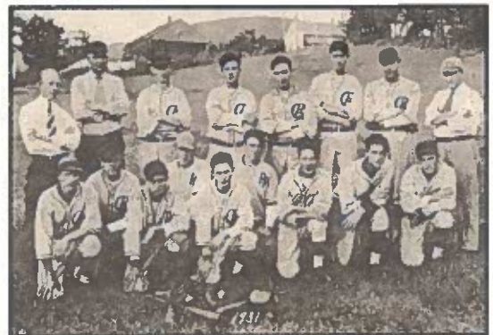
Can you identify this team?