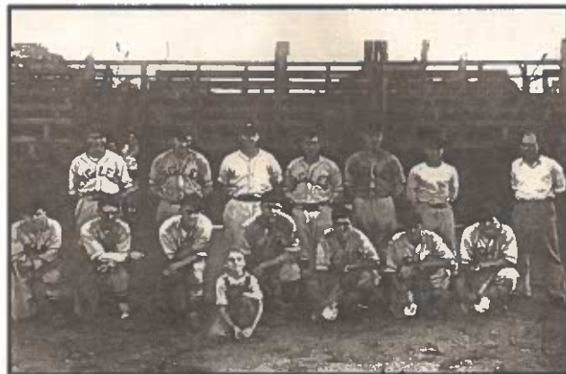
1932 Waynesboro Eagles Baseball Team