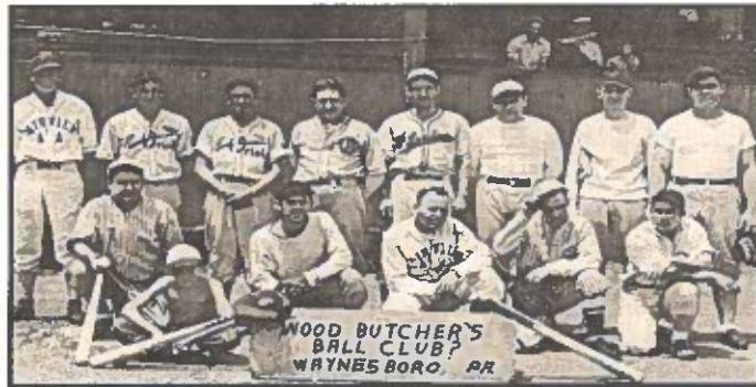
Wood Butcher Ball Club