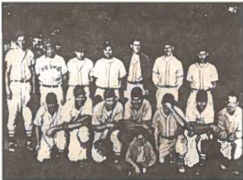
1947 American Legion Post 15 Team