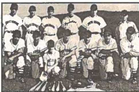
1949 Washington County League