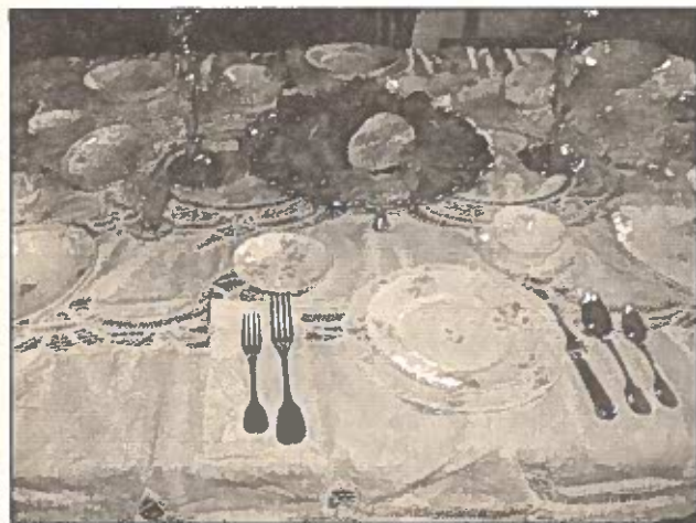
Dining Room Table