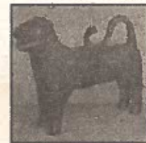
Visitors will be delighted by the new exhibit of John Bell Pottery that is planned. This modern exhibit will be one of the centerpieces of the visitor's center.