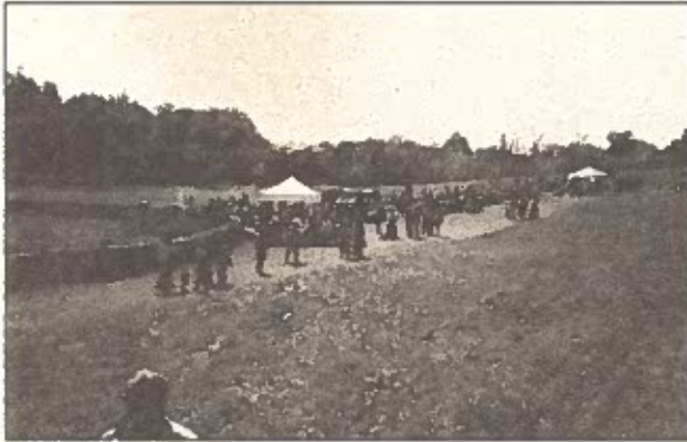
Above is a photograph of last year's Pumpkin Fest

This year's corn maze has once again been a major success. Despite nights of questionable weather the many brave maze volunteers have worked overtime to ensure that this event is a success. In addition to this, the annual Pumpkin Fest was also a big success.