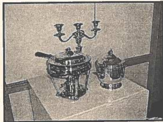
An assortment of fine silver from the Nicodemus Collection may be found in “Exploring Emma’s Attic.” Pictured above from left to right: Warmer/Serving Pan, Candelabra and Monogrammed Ice Bucket.