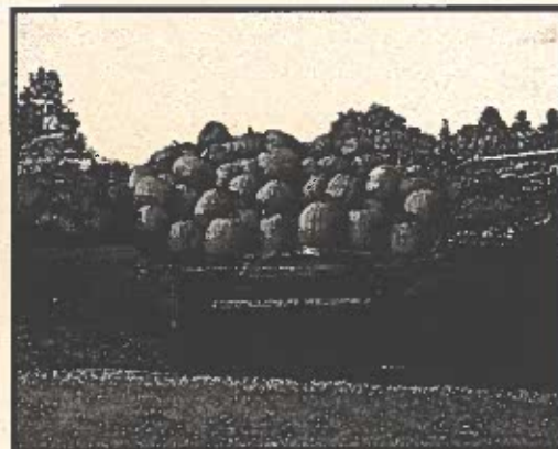
A bountiful harvest of pumpkins from Renfrew's own patch are piled high on a wagon waiting for visitors at the annual Pumpkin Festival. Renfrew will have dozens of quality pumpkins available for purchase this year. Purchase your pumpkin at Renfrew and we will even help you carve it!

Membership Application - Use it for your renewal or pass it on to a friend. Page 5