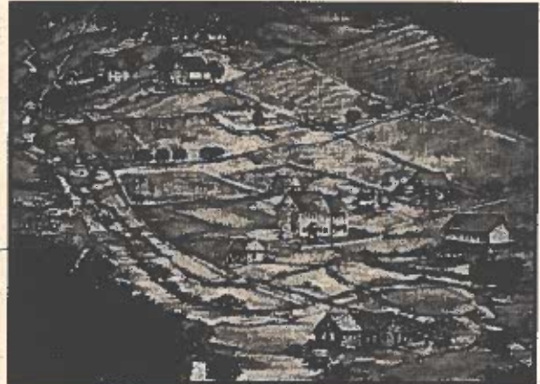
Seven Clyde Roberts original watercolors, including this interpretive view of the Royer Farmstead as it may have looked during the first part of the 19th Century, will be on display as part of "Exploring Emma's Attic," the final exhibition of 2000.

New Exhibition Now Open - Visit this fall to see "Exploring Emma's Attic: Seldom-Seen Treasures from the Nicodemus Collection." Details on page two inside this issue.