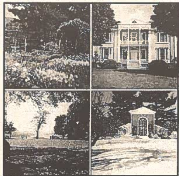
Top image: Washington Irving's legendary Headless Horseman of Sleepy Hollow. Above images: "Four Seasons at Boscobel Restoration." This site is one of the "hidden treasures" we will visit on the trip.

Message from the Curator - Special Projects and Renfrew's 25th Anniversary, A Community Affair.