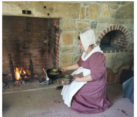
- Learn to hearthcook with Becky LaBarre