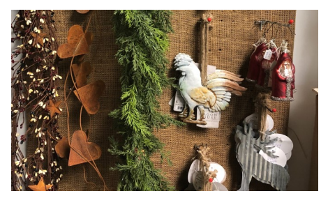
Beautiful seasonal items on sale now!

The Renfrew gift shop is located in the Visitors Center and is open Monday through Friday from 9 am to 4 pm throughout the year. We are closed for certain holidays so please call the office before stopping by to ensure we are open.