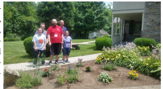
-OSI Clients with their job coaches

We hope that we will be able to continue the partnership next summer.